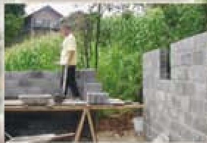
Building a small barn to help the family of a blind man in Kopice become self-reliant. Built with funds and staff support from Connecticut Friends of Bosnia and a donation from the soldiers of SFOR 14, the barn will house 50 chickens, 5 sheep, and a cow.