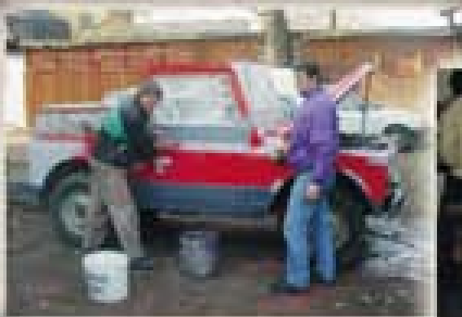
Members of the Tuzla Deaf Association repairing a car. CBD programs helped create seven jobs at the deaf association in car repair, sewing, rug cleaning, a car wash, internet center, and a café.