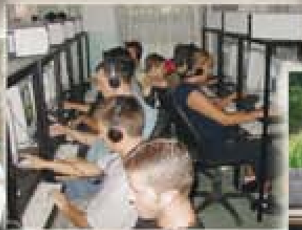
Students from Tuzla University at a computer center created by the Student Club for People with Special Needs and the Student Dorm Association. The center was created with over $20,000 in funding from CBD and employs 16 students and generates funding for student programs and is now entirely independent and self-sustaining.